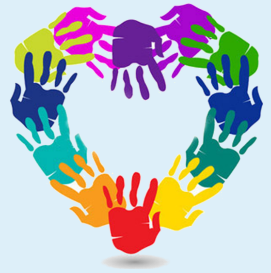
•12 New Members Added in 2019• •22 Total Members•

• HPG meetings are open to the public and all are welcome to attend. The next HPG meeting is scheduled for May 8th and 9th at the Best Western Premier Central Hotel located at 800 E. Park Drive, Harrisburg, PA 17111. Meetings begin promptly at 9:00 a.m.